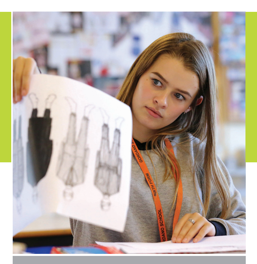
Specific course details are provided in the 'Course Handbook', which is to be found inside the back cover of this prospectus.

Any Sixth Form student who has not yet achieved crucial grades in English Language or Maths GCSE is enrolled in retake classes.