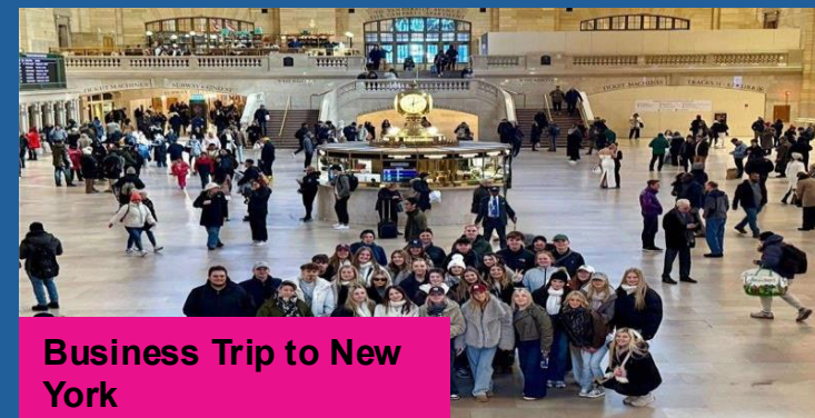
Business Trip to New York