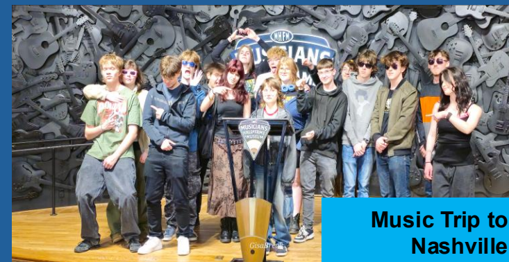
Music Trip to Nashville