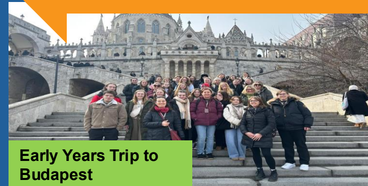
Early Years Trip to Budapest